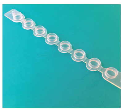
Closure option B79701-1