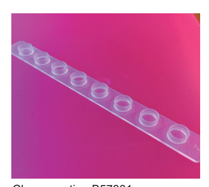
Closure option B57801