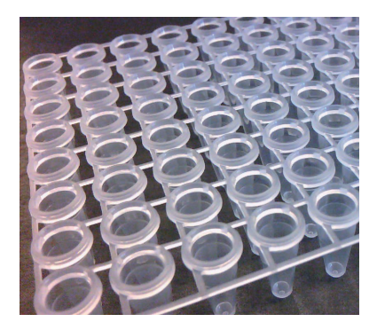
K59701 ultra clear

Designed and manufactured in The Netherlands. Samples on request.