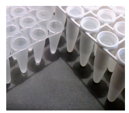
Low- & Regular profile